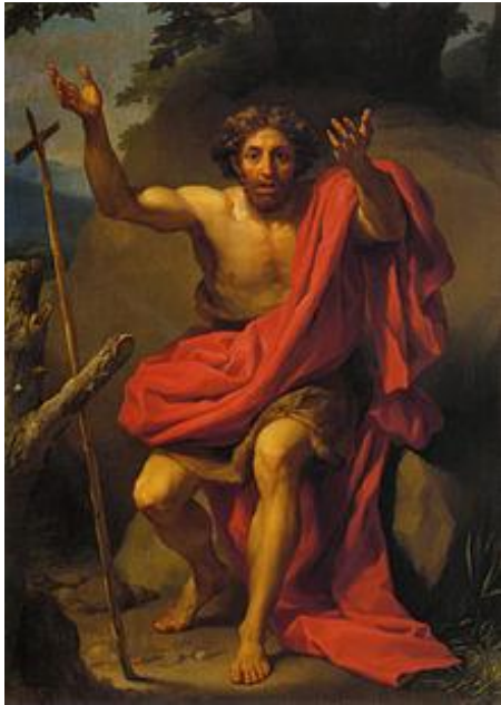
Unknown artist - wiki/John_the_Baptist

Repent, for the kingdom of heaven is at hand! (cf. Matthew 3: 2).