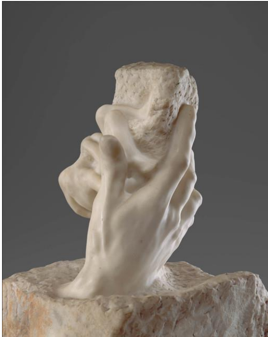
The Hand of God, Rodin, 1896-1907. Metropolitan Museum of Art.

Meeting God at an hour we do not expect (cf. Matthew 24: 44; 25:13).