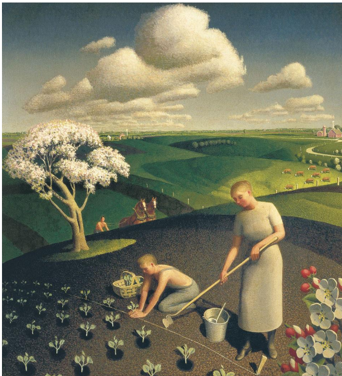
Spring in the country – Grant Wood, 1941. Cedar Rapids Museum of Art, Iowa.