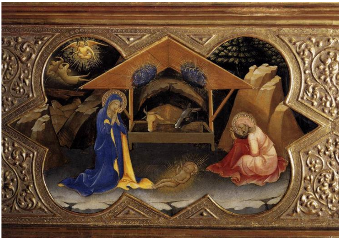
Nativity - Lorenzo Monaco.1414 www.wikiart.org/en/lorenzo-monaco/nativity-1414