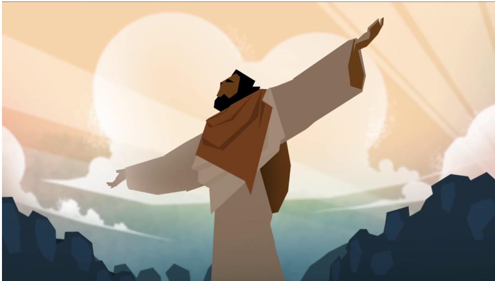
You Tube animation.

Behold, I send my messenger before your face (cf. Matthew 11: 10a).