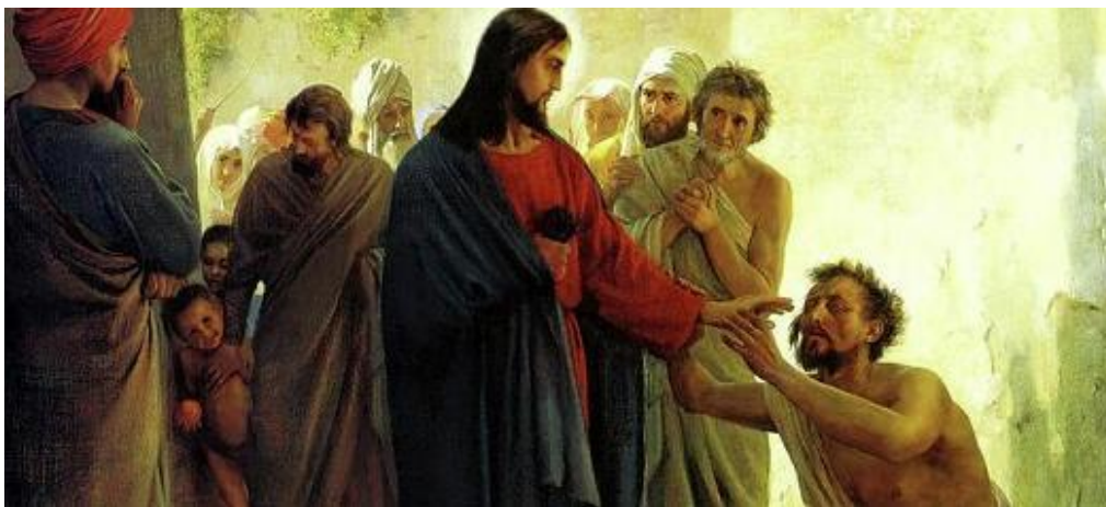
Jesus healing the sick. Artist unknown.