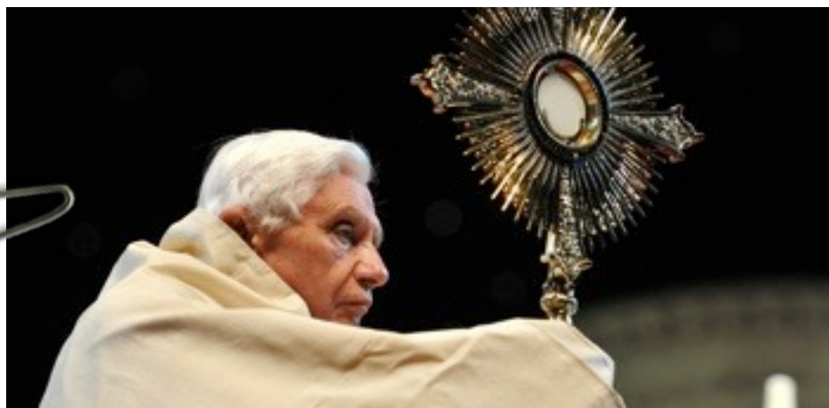
Pope and pilgrims in Hyde Park, September 2010