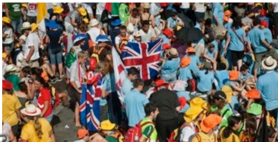
World Youth Day Madrid, 2011

Coordinated by the Home Mission Desk, Catholic Bishops' Conference of England and Wales. Email: Mission.Volunteer@cbcew.org.uk