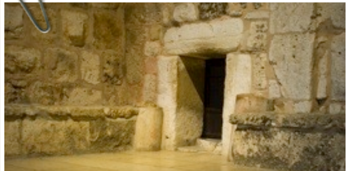
The main entrance to the Church of the Nativity, Bethlehem

+ Bishop Kieran Conry , Chair, Department for Evangelisation and Catechesis, Catholic Bishops’ Conference of England and Wales