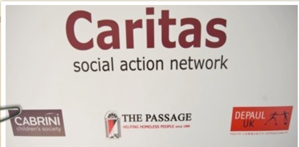
Caritas Social Action Network - Vision and Values day