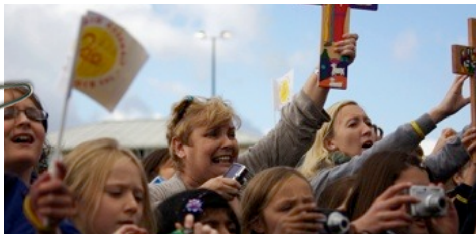
Celebration of Catholic Education, St Mary's University College, Twickenham