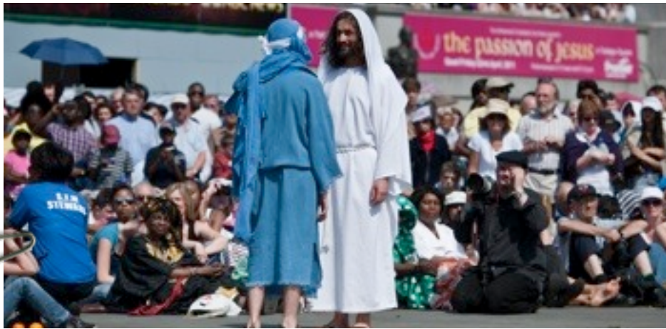
Passion of Jesus in Trafalgar Square, London