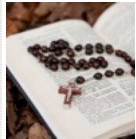
Bible and rosary

“...the Year of Faith will have to see a concerted effort to rediscover and study the fundamental content of the faith.”