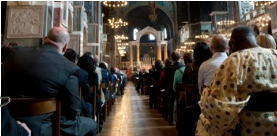
Thanksgiving Mass for the Sacrament of Marriage in Westminster Cathedral