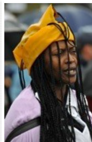
A Papal Visit pilgrim, 2010