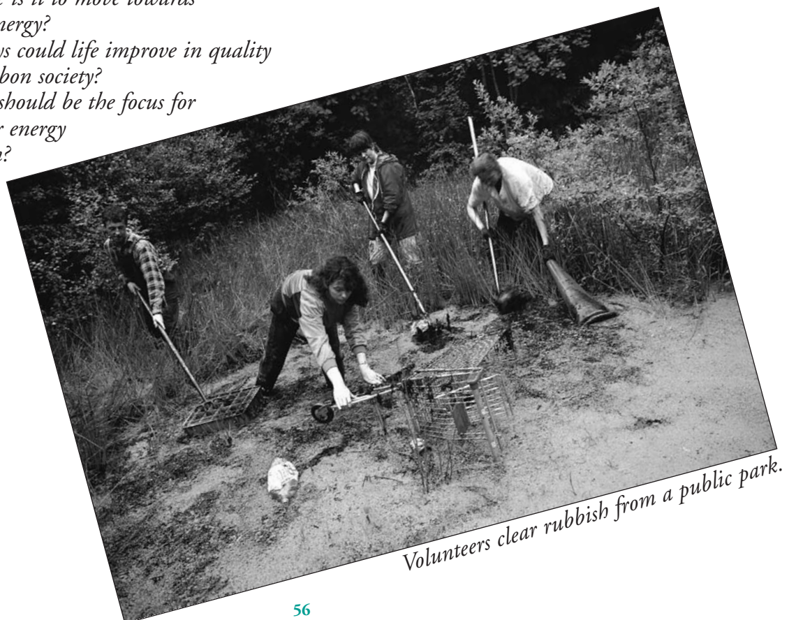
Volunteers clear rubbish from a public park.

Look at the ideas and resources listed on Reflection and Action Sheet 6.