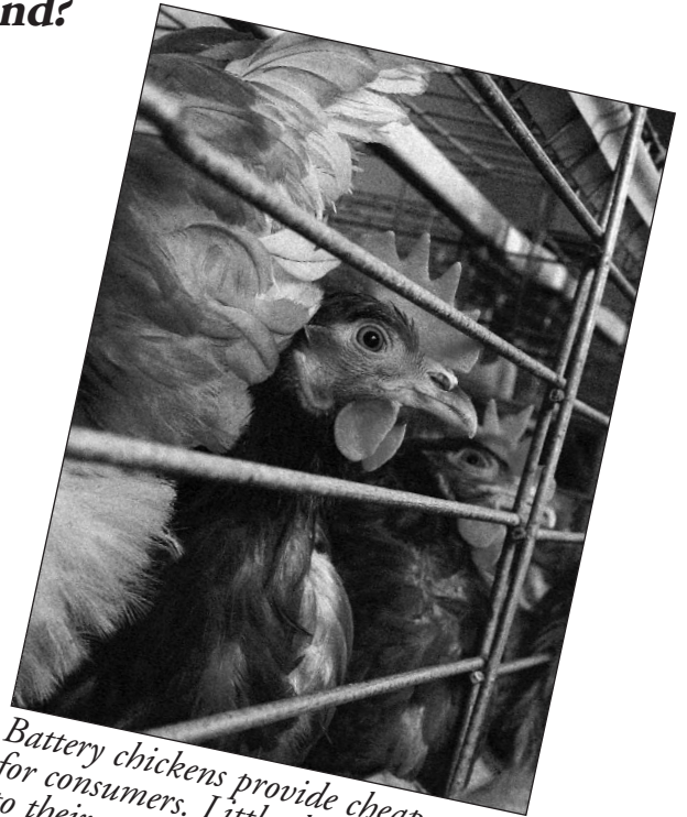
Battery chickens provide cheap meat for consumers. Little thought is given to their welfare.

We have confronted the obstacles to prompt action and found them to be powerful and insidious. The industrial-consumption-oriented development model that characterises the richest countries and which others seek to emulate is driven by strong economic and political forces whose goal is primarily greater concentration of