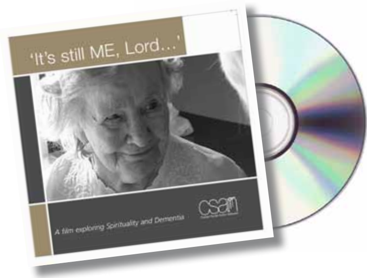
Distribution of DVDs to all parishes