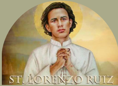
SAINT LORENZO RUIZ

Saint Lorenzo Ruiz is the patron saint of the Philippines. Born in Manila, he was martyred in Japan during the persecution of Christians in the 17th century. After being falsely accused of killing a man, Saint Lorenzo sought asylum on board a ship with four priests and another layman. They sailed for Japan, where they were imprisoned and subsequently tortured by being hung upside down over a pit. Refusing to renounce his faith, Saint Lorenzo died two days later. His last words were: "I am a Catholic and I do wholeheartedly accept death for God. Had I a thousand lives, all these to Him would I offer." Saint Lorenzo was canonised by Pope John Paul II in 1987, making him the first Filipino saint. The feast of Saint Lorenzo Ruiz and companions is celebrated on 28 September.