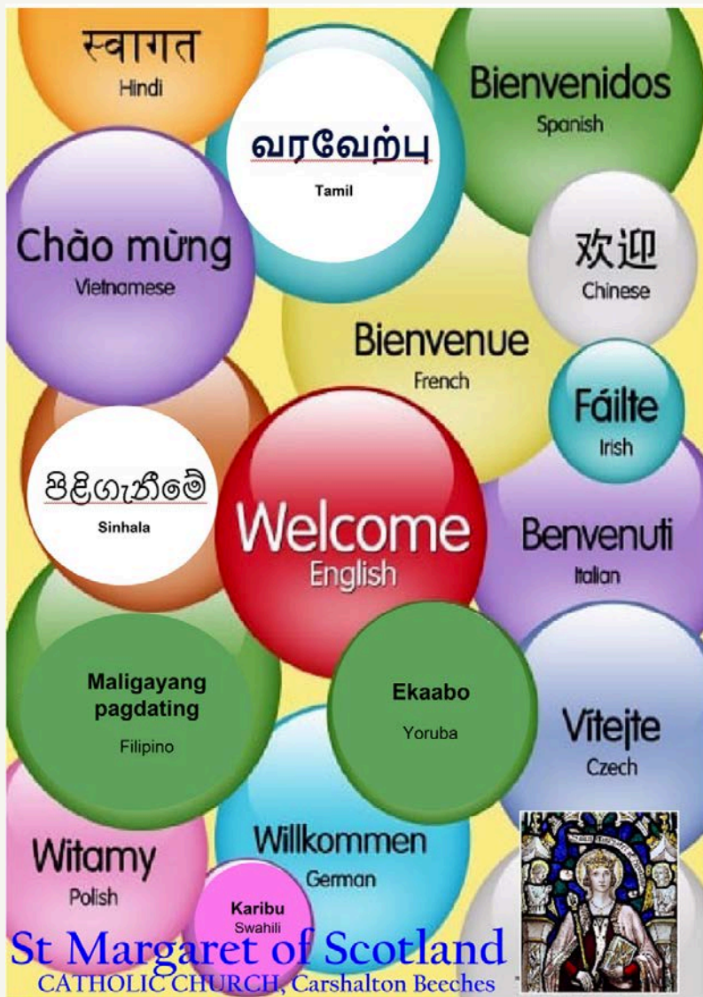
ST MARGARET'S WELCOME NOTICE

A further way of welcoming new parishioners is to hold regular sessions – for example, these could be held twice a year for those who have joined the parish in the previous six months. These sessions can include presentations about the worship and activities in the parish; provide an opportunity for new arrivals to talk about themselves and their families; and enable new parishioners to ask questions, seek advice and share their early impressions of the parish.