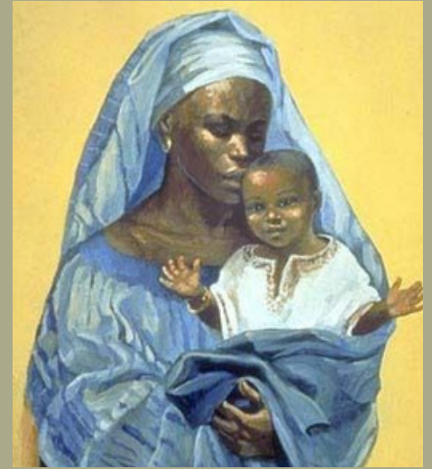
MARY HOLDING JESUS

At the beginning of the 2020s this was also true of Saint Margaret of Scotland Church in Carshalton. Until the Racial and Cultural Inclusion Group began its work, all the images, statues and pictures in the church were of white people. Taking the view that all parishioners should see images of people like them in the church, the group obtained pictures of Black and Asian saints and displayed them in the church alongside those of white European saints. The pictures obtained included images of Saint Charles Lwanga and companions (Uganda), Saint Joseph Vaz (from Goa, missionary to Sri Lanka), Saint Euphrasia Eluvathingal (India) and Saint Martin de Porres (Peru). Brief descriptions of each saint's life were added below each picture. A statue of Saint Martin de Porres was also commissioned and added to the existing statues in the church.