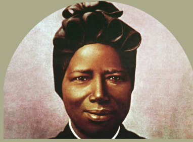
SAINT JOSEPHINE BAKHITA

Saint Augustine Zhao Rong is one of 120 people who were martyred for their faith in China between 1648 and 1930. Eighty-seven were Chinese people and thirty-three were Western missionaries. Saint Augustine Zhao Rong was a soldier who was assigned to escort a French priest. The priest's example led him to convert to Catholicism and he became a priest. After a short period of priestly ministry, Fr Augustine was jailed, tortured and left to die in prison during the reign of an emperor who was bitterly hostile to Christianity. The feast of Saint Augustine Zhao Rong and companions is celebrated on 9 July.