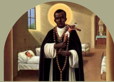
ST MARTIN DE PORRES VELAZQUEZ O.P

Saint Lorenzo Ruiz is the patron saint of the Philippines. Born in Manila, he was martyred in Japan during the persecution of Christians in the 17th century. After being falsely accused of killing a man, Saint Lorenzo sought asylum on board a ship with four priests and another layman. They sailed for Japan, where they were imprisoned and subsequently tortured by being hung upside down over a pit. Refusing to renounce his faith, Saint Lorenzo died two days later. His last words were: "I am a Catholic and I do wholeheartedly accept death for God. Had I a thousand lives, all these to Him would I offer." Saint Lorenzo was canonised by Pope John Paul II in 1987, making him the first Filipino saint. The feast of Saint Lorenzo Ruiz and companions is celebrated on 28 September.