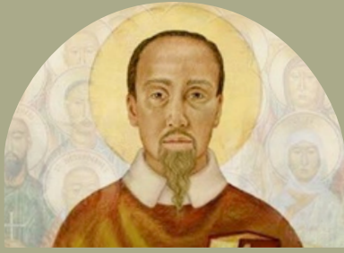
SAINT AUGUSTINE ZHAO RONG 1746-1815

Saint Augustine Zhao Rong is one of 120 people who were martyred for their faith in China between 1648 and 1930. Eighty-seven were Chinese people and thirty-three were Western missionaries. Saint Augustine Zhao Rong was a soldier who was assigned to escort a French priest. The priest's example led him to convert to Catholicism and he became a priest. After a short period of priestly ministry, Fr Augustine was jailed, tortured and left to die in prison during the reign of an emperor who was bitterly hostile to Christianity. The feast of Saint Augustine Zhao Rong and companions is celebrated on 9 July.