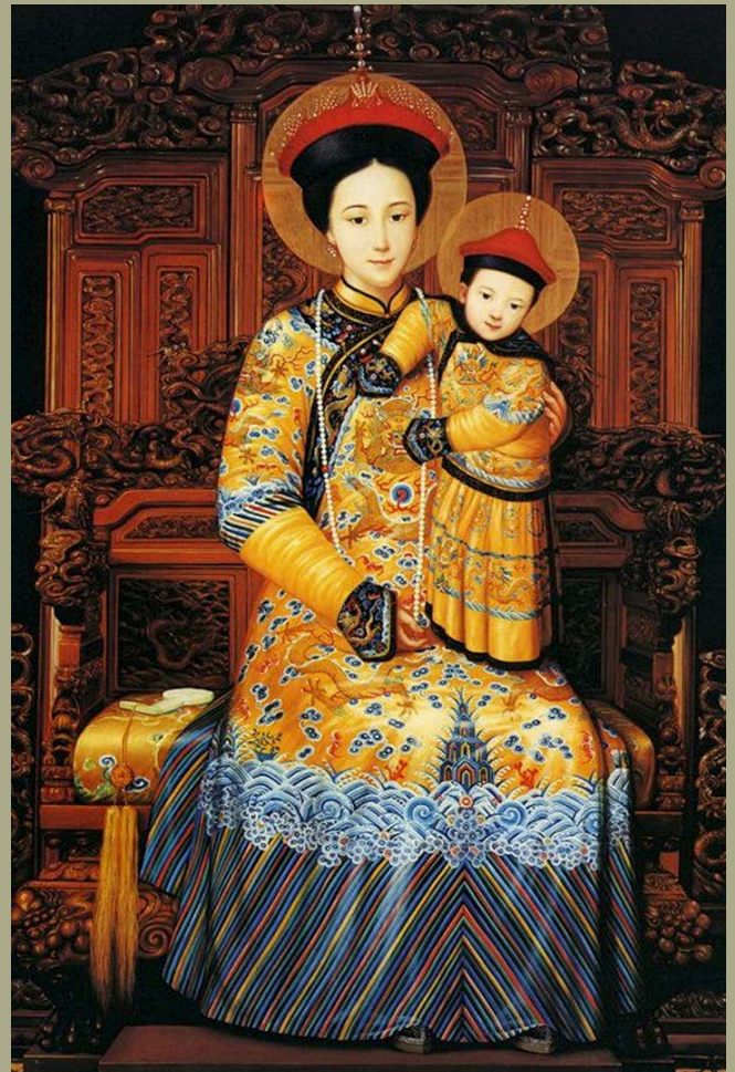
OUR LADY OF CHINA