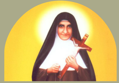
SAINT EUPHRASIA ELUVATHINGAL

Saint Josephine Bakhita was born in the Darfur region of Sudan in 1869. At the age of seven she was seized by slave traders. She was bought, sold and given away more than 12 times before being freed in 1889. She was left with the Canossian sisters, where she encountered Christianity for the first time. She entered the novitiate and spent the rest of her life in the Canossian convent in Schio, northern Italy. Saint Bakhita is the patron saint of Sudan and of survivors of human trafficking. Her feast day is celebrated on 8 February, which is the International Day of Prayer Against Human Trafficking.