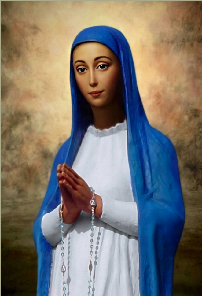
OUR LADY OF KIBEHO

Costs: The statue was the single most expensive item. However, the cost of purchasing diverse items and of framing printed images did not affect the parish's finances as individual parishioners covered the cost of all the purchases with specific donations.