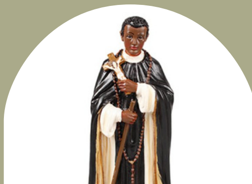
STATUE OF ST MARTIN DE PORRES

Prints were also obtained of the Ascension of the Lord and of Mary holding Jesus taken from the Vie de Jesus Mafa series. This series of pictures of the life of Jesus was created at the initiative of a French missionary to help to spread the Gospel in Northern Cameroon. Local people re-enacted scenes from the Gospel and these scenes were reproduced by an artist. They formed the basis of a set of 63 Images in which Jesus, Mary and other characters in the Gospels are depicted as Black people in local dress and African settings.