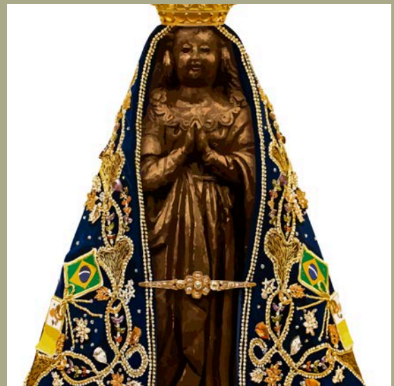
OUR LADY APARECIDA

Our Lady Aparecida is the Patroness of Brazil. In 1717 in Guaratingueta, Brazil, three fishermen were fishing in preparation for a local feast in honour of the visiting Governor of Sao Paulo. After having little success, the fishermen prayed to Our Lady and cast their nets again. They dragged up a statue of the Virgin Mary (a black version of Our Lady of the Immaculate Conception), following which they had a large catch of fish. Devotion to the statue grew rapidly and many miracles were attributed to Our Lady Aparecida. The statue is now in the Basilica of Our Lady Aparecida in Sao Paulo. The building is the largest Marian shrine in the world.