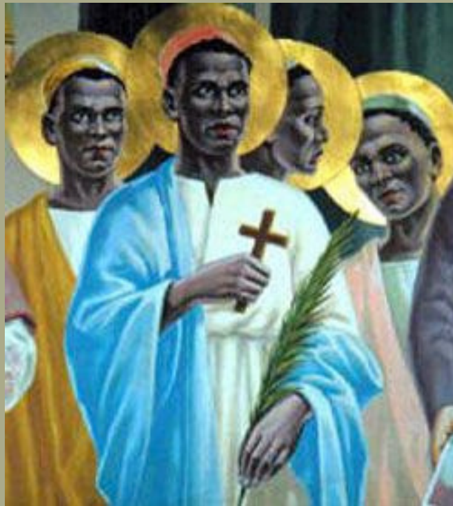
SAINT CHARLES LWANGA AND COMPANIONS

Saint Charles Lwanga was a Ugandan convert to the Catholic faith who was martyred with a group of companions in 1886. Charles Lwanga served in the court of King Mwangwa II of Buganda, who insisted that Christian converts should abandon their new faith. Charles was in charge of the royal pages and he often protected the boys in his charge from improper advances by the King. On 25 May 1886 the King interrogated members of his court to see whether they would renounce Christianity. Led by Charles Lwanga, the royal pages declared their fidelity to their faith, upon which the King condemned them to death. Charles was burned to death together with 12 other Catholic men and boys and nine Anglicans. Saint Charles Lwanga and his companions were canonised by Pope Paul VI in 1964.