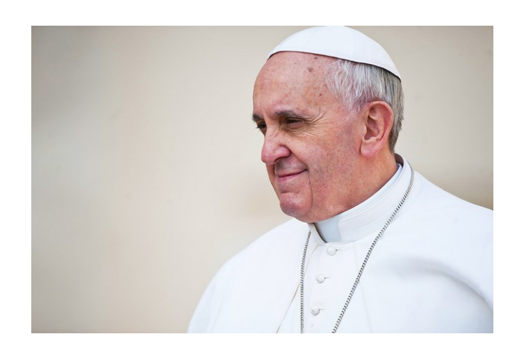
Evangelii Gaudium 28

'The parish is not an outdated institution; precisely because it possesses great flexibility, it can assume quite different contours depending on the openness and missionary creativity of the pastor and the community. While certainly not the only institution which evangelizes, if the parish proves capable of self-renewal and constant adaptivity, it continues to be "the Church living in the midst of the homes of her sons and daughters".[26] This presumes that it really is in contact with the homes and the lives of its people, and does not become a useless structure out of touch with people or a self-absorbed group made up of a chosen few. The parish is the presence of the Church in a given territory, an environment for hearing God's word, for growth in the Christian life, for dialogue, proclamation, charitable outreach, worship and celebration.[27] In all its activities the parish encourages and trains its members to be evangelisers.[28] It is a community of communities, a sanctuary where the thirsty come to drink in the midst of their journey, and a centre of constant missionary outreach. We must admit, though, that the call to review and renew our parishes has not yet sufficed to bring them nearer to people, to make them environments of living communion and participation, and to make them completely mission-oriented.'