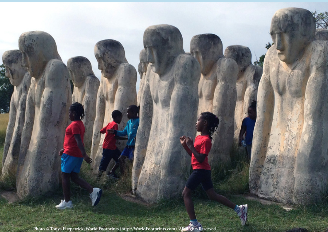
Photo © Tonya Fitzpatrick, World Footprints ( http://WorldFootprints.com ). All rights Reserved.

Your right hand, O LORD, glorious in power (Ex 15:6)