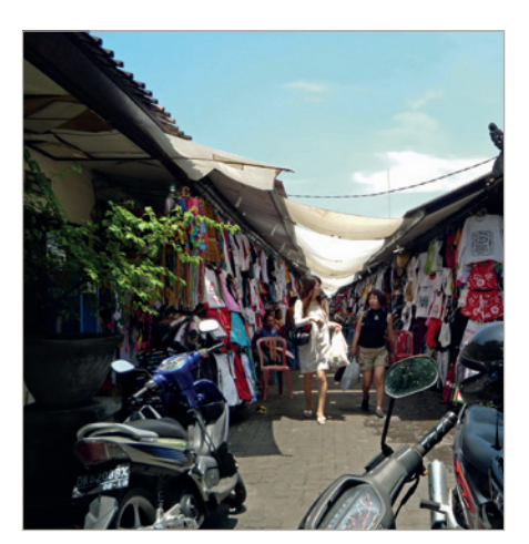
Shopping in Bali