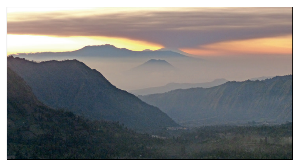
Beautiful landscapes contrast with urban sprawl

infects politics and business, often with devastating effects on the environment. Meanwhile those who are supposed to promote justice and protect the weak fail to do so. As a consequence, a country rich in resources bears the burden of many people living in poverty. This is reflected in a traditional Indonesian saying, "A mouse dies of hunger in a barn full of rice". Particular ethnic and religious groups are often associated with wealth in ways that have fed tensions. As a result the radicalization that pits one community against another has grown and is exacerbated by the misuse of social media to demonize particular communities.