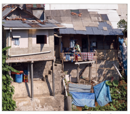
Slums in Bogor

God of the seasons, whether in bountiful harvest, or when there is no yield for what we have sown; let us be content, that your grace is sufficient. Help us to have the generosity of spirit, to share what we have with those who have not. May we all be blessed with love, grace, compassion and mercy, as we seek to walk humbly and do justly, for your name's sake. Amen.