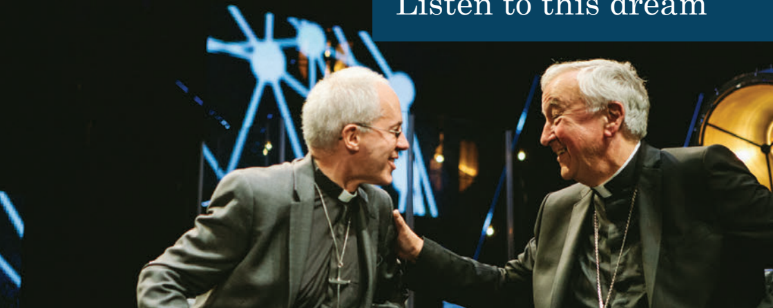
Archbishop of Canterbury, Justin Welby, with Cardinal Vincent Nichols at the Leadership Conference 2015