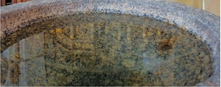
The bowl of St Meinhard's font now in Riga

Christianity was first brought to Eastern Latvia in the 10th century by Byzantine missionaries. Latvia's story includes the evangelising mission of St Meinhard two hundred years later, and other German missionaries. Riga was one of the first cities to adopt Luther's ideas in the 16th century. In the 18th century, Moravian missionaries revived and deepened Christian faith throughout the country. Their descendants were to play a central role in laying the foundations for national independence in 1918.