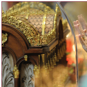
The relics of St Therese of Lisieux Visit England and Wales