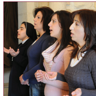
Supporting the Church in the Holy Land