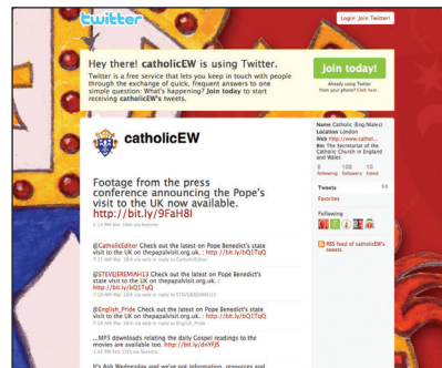
Twitter Our tweets www.twitter.com/catholicew