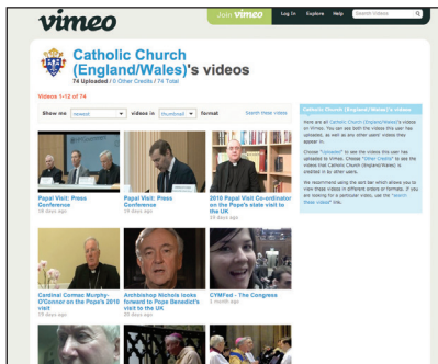
Vimeo The Catholic Bishops' Conference of England and Wales Video Channel www.vimeo.com/catholicism/videos