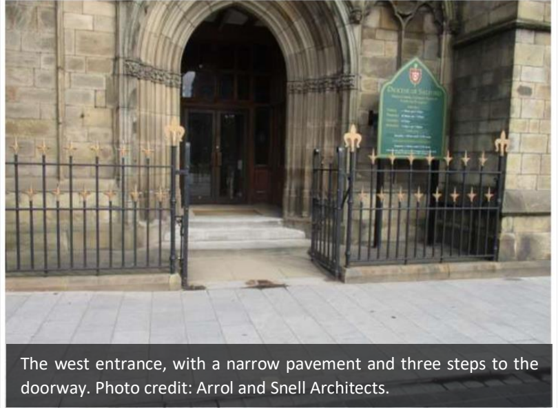
The west entrance, with a narrow pavement and three steps to the doorway. Photo credit: Arrol and Snell Architects.

Safe and level access to the cathedral was urgently needed. The main west entrance was inaccessible to wheelchair users as it had three steps, and the recent introduction of level surface treatments to the public road and pavement beyond had reduced the distinction between them, which meant that people leaving the cathedral were walking out directly towards the bus lane. This was considered a real hazard, especially after a major event, and the cathedral was keen to open up the north porch as a new principal entrance. It was barely used, opening onto an unattractive area of modern concrete paving, and its rainwater downpipes discharged directly into the ground, creating damp problems in the surrounding area and the cathedral interior.