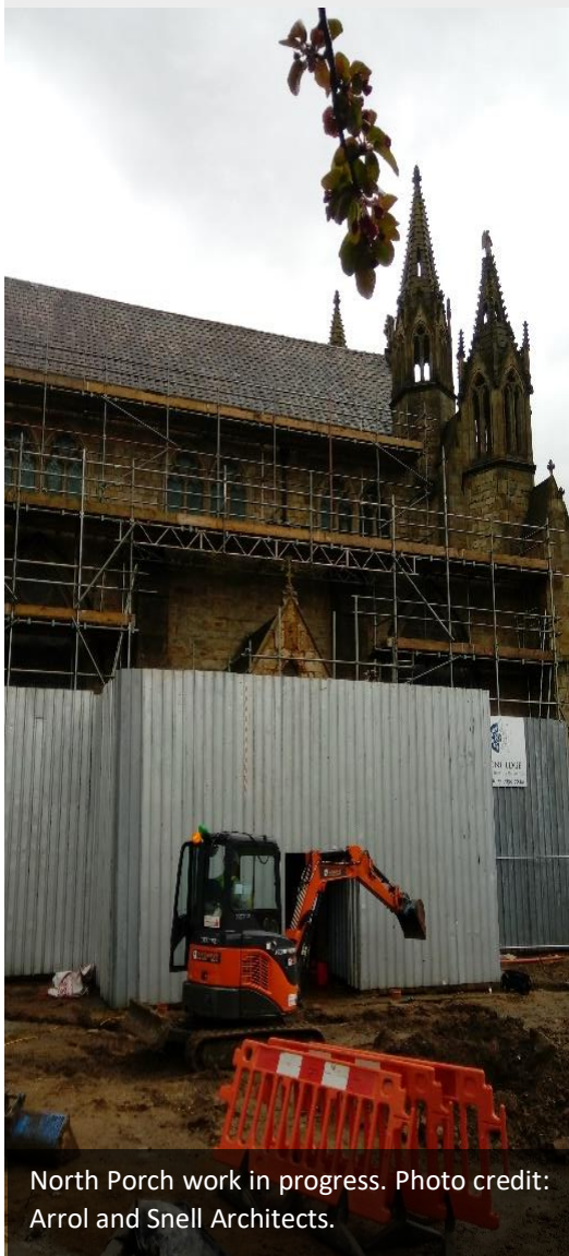
North Porch work in progress.