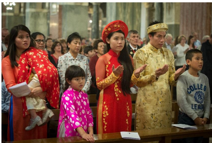
International Mass with Ethnic Chaplaincies in Westminster Cathedral