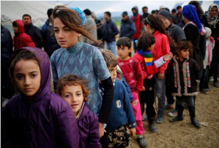
Unaccompanied minors at a refugee camp in Greece