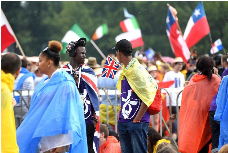
Pilgrims at the opening mass for World Youth Day 2016