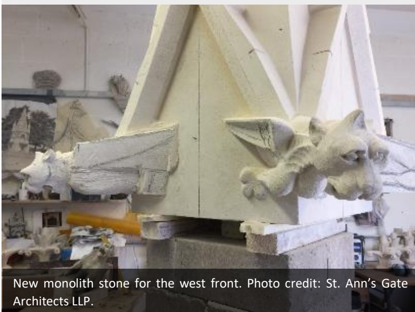
New monolith stone for the west front.