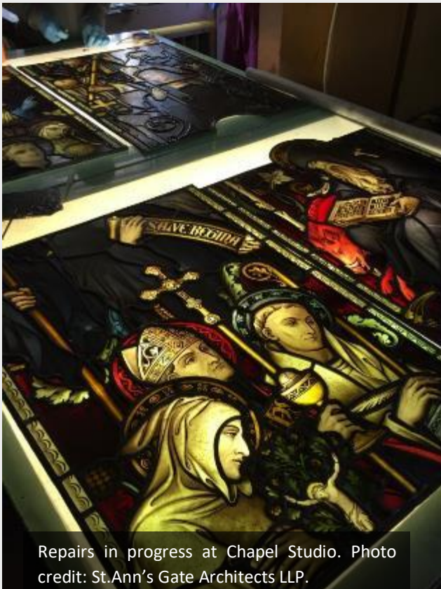
Repairs in progress at Chapel Studio.

As part of the First World War centenary commemorations, Arundel Cathedral is creating displays of information for visitors about the repair works and the history of the building. It receives in the region of 70,000 visitors per year.