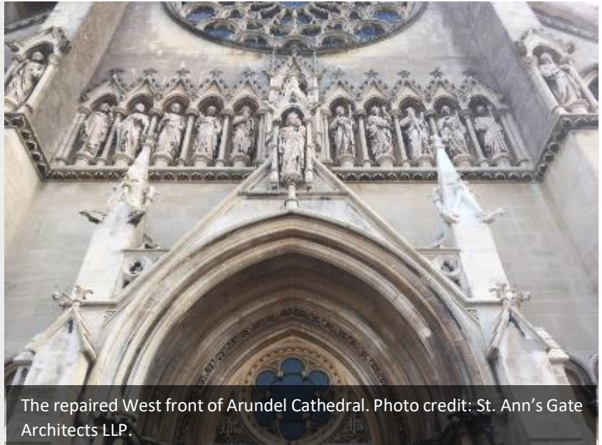
The repaired West front of Arundel Cathedral.

The Cathedral Church of Our Lady and Saint Philip Howard, built in 1873 in a French Gothic style by the architect Joseph Hansom, was designated a cathedral in 1965. As such it serves as the mother church of the Catholic parishes throughout East and West Sussex, Surrey, and Brighton and Hove.